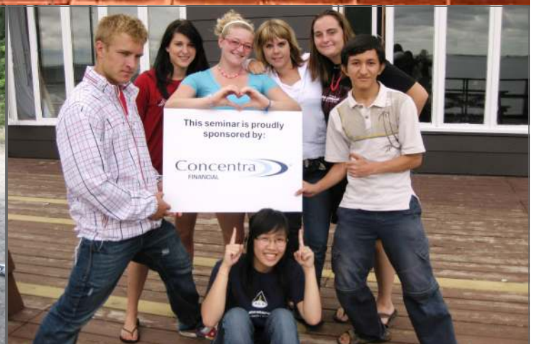
Participants from Senior Grad (left) and Grad (right) strike a pose for their seminar sponsors!