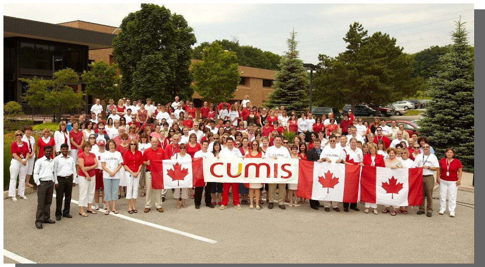
CUMIS employees and local dignitaries gather for the singing of 'O Canada' at the CUMIS head office in Burlington, Ontario

When was your organization established? CUMIS' roots in Canada date back to 1937 with the signing of CUNA Mutual Insurance Society's first Canadian loan protection contract, which was for Dalhousie Industrial Credit Union in New Brunswick. While the organization's corporate names and structures have changed and products and services have evolved since then, its founding vision of serving financial co-operatives has remained the same.